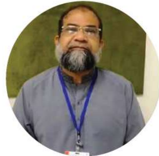
Syed Ahmer Hamid Children Cancer Hospital Karachi, Pakistan