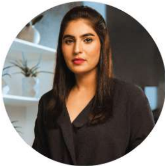
Ayesha Sarwari Women's Advancement Hub Islamabad, Pakistan