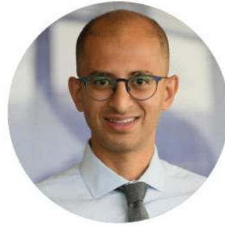
Ahmed Gilani Children's Hospital Colorado Aurora, USA